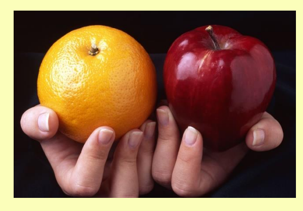
Fruit U and I eat fruit