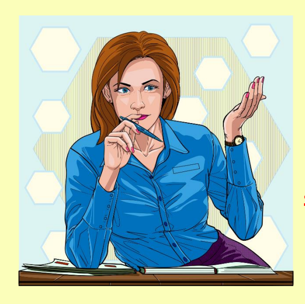
Secretary A secretary keeps a secret